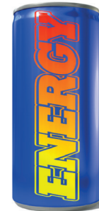
Aluminium drinks can